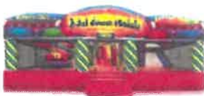
Fun Fair Toddler 1 - $325.00