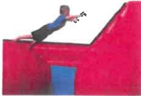
Big Baller 1 - $695.00