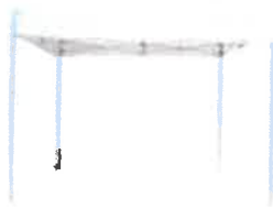
Tent - 10x10 1 - $100.00