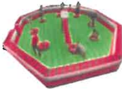
Toxic Inferno Meltdown 1 - $1,695.00