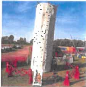
24' Mobile Rockwall 1 - $1,500.00