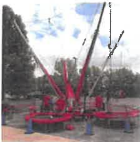
4 Player Bungee Trampoline 1 - $2,549.00