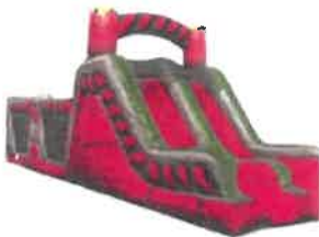
45' Nuclear Inferno 1 - $475.00