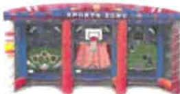
Sports Zone - D11 1 - $350.00