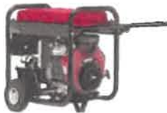
Generator 4 - $1,000.00