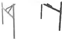
5' Round Tables 14 - $420.00