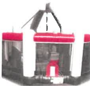
Wrecking Ball 1 - $519.00