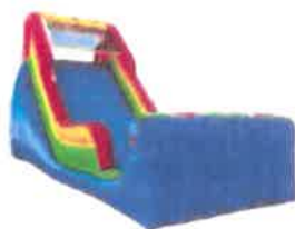
16' Climb and Slide 1 - $325.00