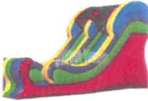
16' KidZone Slide 1 - $325.00