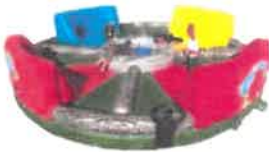
Hippo Chow Down 1 - $595.00