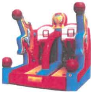
All Star Basketball 1 - $300.00