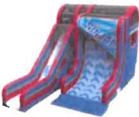
Ninja Warped Wall 1 - $695.00