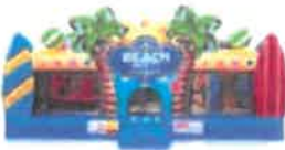
Beach Party Toddler 1 - $325.00