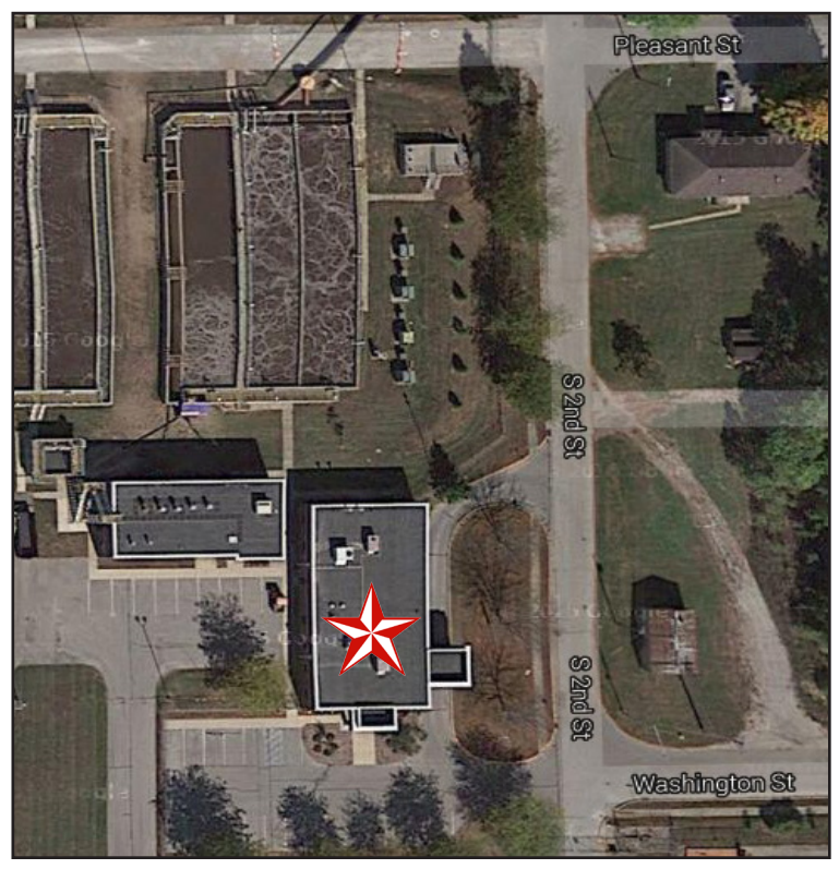
Noblesville Utilities, 197 W. Washington Street