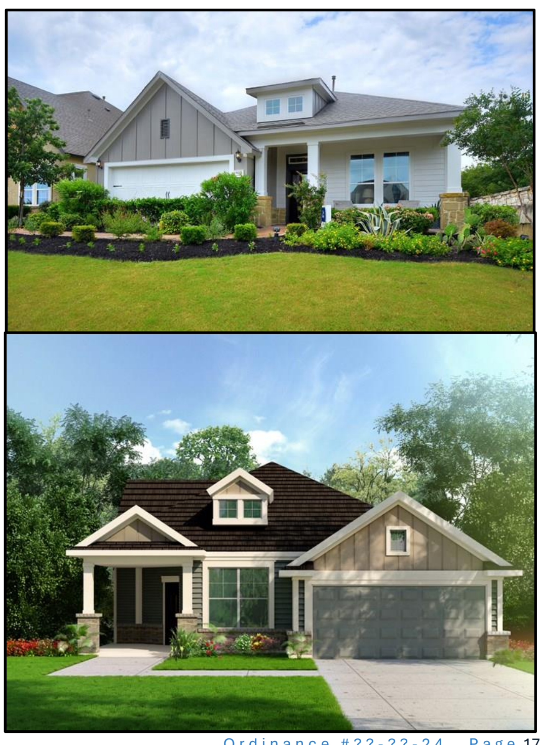
Ordinance #??-??-24 Page 17 | 21